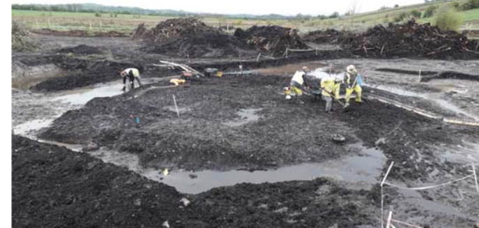
Burnt Mound discovered by AMS in Cloonlurg townland

In April of this year, mobilisation commenced with the establishment of site compounds at Toberbride Business Park and Drumfin South off the local road L-1502-32. Extensive archaeological and ecological surveys were initially carried out prior to the main works commencing and are continuing at various locations throughout the site. Site clearance and demolition works are also ongoing. Plant and equipment continue to arrive on a weekly basis in preparation for the bulk earthworks which has commenced but will continue to increase until full production is achieved next month.